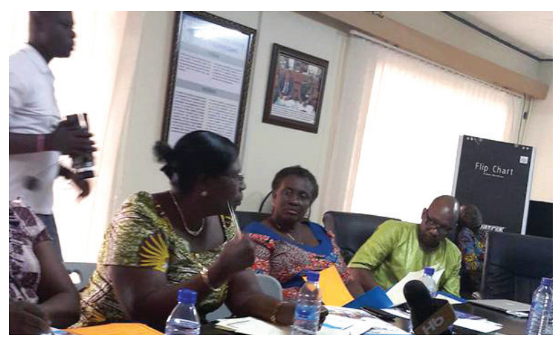
Organisers meet to unanimously adopt the African Declaration on Internet Rights and Freedoms.