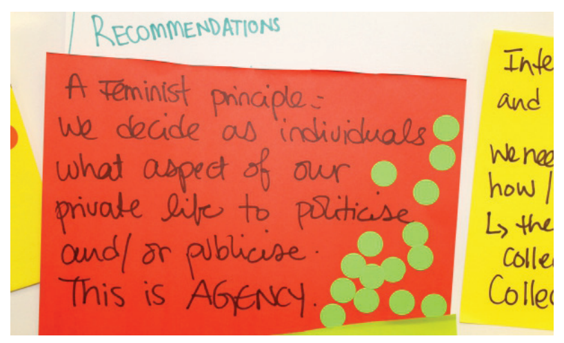
Feminist Principles of the Internet were collaboratively generated both online and in a face-to-face meeting.

In 2014, APC launched the second global survey on sexuality and the internet, which aims to monitor the value of the internet for sexual rights advocates, as well as the risks and threats they face online. It was translated into eight languages, and received 376 complete responses (out of a total of 946 responses) between August and November 2014.