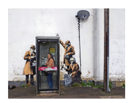
Edward Snowden revealed that GCHQ has been using criminal techniques to spy on potentially millions of people

Tribunal" to investigate the breach of fundamental rights involved in attacks against ISPs.