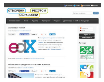
The OER online resource centre currently contains about 400 resources.

The Metamorphosis Foundation launched the Open Educational Resources (OER) Initiative in 2012 to contribute to the development of critical thinking and democratisation in Macedonia, through the constructive use of new technologies as tools for increasing the quantity and quality of educational, scientific and academic e-content.