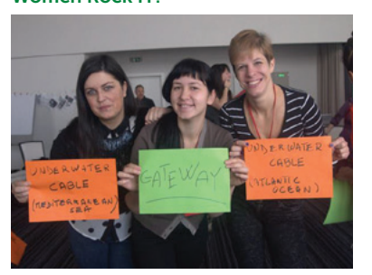
Women from Bosnia and Herzegovina, Serbia, Macedonia, Montenegro and Croatia participated in Women Rock IT!

OWPSEE's Women Rock IT, the first ever regional training on ICT and violence against women (VAW), was held in mid-December in Sarajevo. During five full days of training, the 26 participants learned about tools for online personal safety (including the creation of strong passwords for the protection of personal data and privacy), tools for secure communication (alternative software),