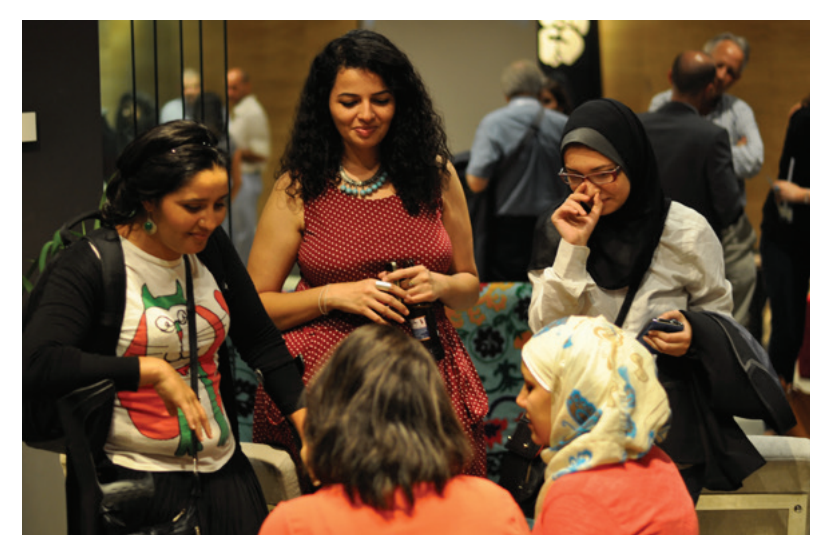
A disco-tech is a social event that brings technological solutions and discussion into an advocacy space like the IGF.