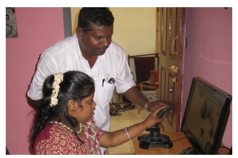
SPACE, the APC-member recipient of the 2014 Chris Nicol FLOSS Prize, reaches a vast community through its educational programmes at computer centres in Kerala, India.

of the 2014 APC Member FLOSS Prize for an individual or organisation within the APC membership is the initiative Insight – ICT for the Differently Abled, implemented by SPACE Kerala. APC rewarded the initiative with USD 1,500 as it was highly appraised by the reviewers for its achievements not only in terms of the number of users with disabilities that it reached, but also for what it achieved in terms of policy changes in Kerala's educational system.