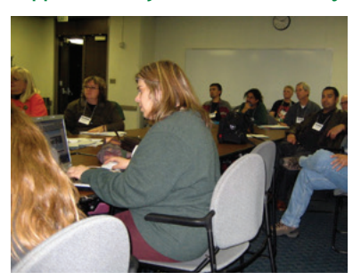
Attendees of the 2014 LaborTech Conference.

LaborNet worked throughout 2014 to support labour communication rights in the United States and internationally. It supported forums on journalists' communication rights and the effects of communication technology on media workers and information rights.