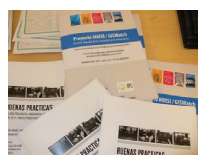
Discussions at Nodo TAU's launch event were around the importance and critical aspects of communications surveillance, the theme of GISWatch 2014.

In collaboration with the local union of journalists, Nodo TAU organised a launch of the 2014 edition of the GISWatch report, which also featured the presentation of a booklet with Spanish translations of the Argentina country reports included in this annual publication from 2010 until 2014. The event was attended by journalists. representatives of civil society organisations, particularly women's organisations, members of local government, and authorities from the local public university, including the director of the department of social communication.