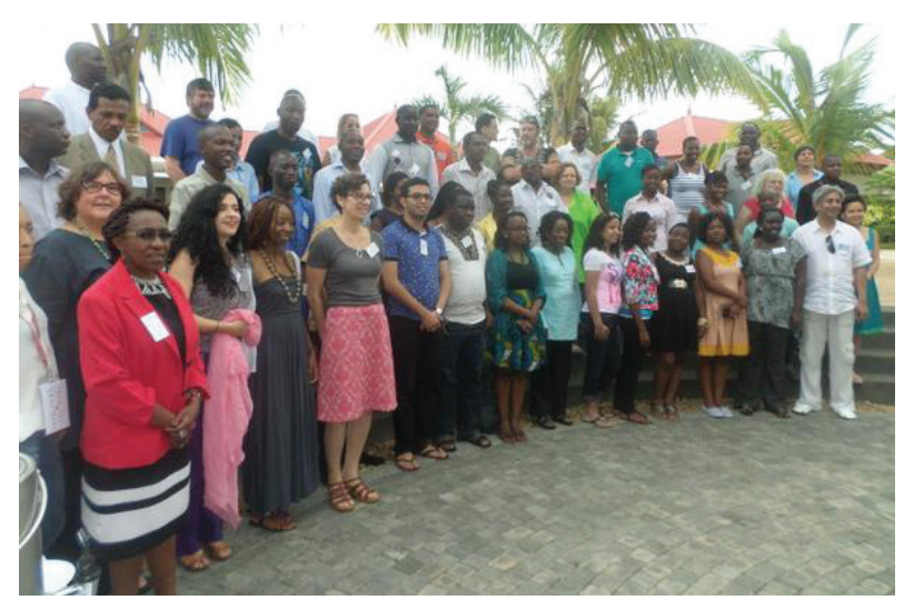
Participants of the African School on Internet Governance 2014 in Mauritius.