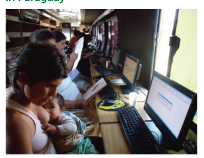
For many participants it was their first opportunity to use a computer, as well as to communicate online with relatives who have migrated to countries like Argentina, Spain and the United States.

As part of its ongoing efforts to expand digital literacy among the Paraguayan population, and especially among those with fewer opportunities due to low income levels, Asociación Trinidad Comunicación, Cultura y Desarrollo created a Community Mobile Telecentre project targeted to female domestic workers in the capital, Asunción, aimed at enhancing