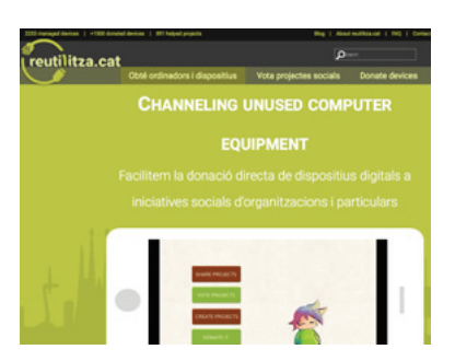
The local Reutilitza.cat campaign as part of eReuse. cat, with our mascot Timmy.

The electronic reuse project initiated several years ago by Pangea and Universitat Politècnica de Catalunya-BarcelonaTech (UPC) aims at creating an open community around the reuse of digital devices – extending their lifetime before recycling – for social, economic and environmental benefit. A set of software tools and online websites assist along the life-cycle of digital devices: from registration and labelling of new devices, to preparation for reuse (data