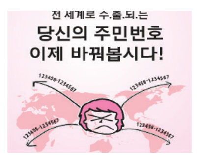
Online campaign banner: "Let's change now your RRN which is exported all over the world".

Since 1991, 400 million leaked Resident Registration Numbers (RRN), or national ID numbers, have been reported – a figure eight times the population of South Korea. On