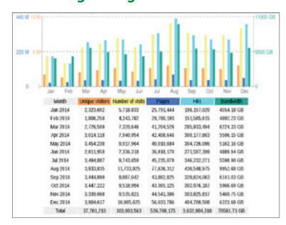
Deflect protects dozens of sites from DDoS attacks.

eQualit.ie protects hundreds of sites from attacks throughout the year and takes on new clients who are in dire need of protection, those who think they just might need some, and also others who simply need a content distribution network. The last vear has seen us deploy the Deflect Dashboard,<sup>33</sup> which greatly improves how users can sign up for protection against DDoS attacks, speeds up the process and offers greater customisability. As this development has progressed, we have also worked towards open sourcing our tooling as it becomes ready.