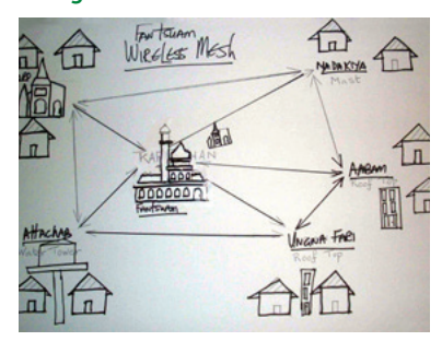
At Fantsuam, the need for computer systems is complemented with an affordable mesh network and reliable solar back-up.

Computer Based Testing (CBT) is the new requirement for Nigerian students who are writing university entrance examinations. CBT centres are usually found in urban centres where it is easier to meet the needs of adequate power back-up and reliable internet access. Rural students are usually allocated to the nearest urban centre, but sometimes they get allocated to centres far away from their homes. The logistics of road travel, accommodation and feeding to attend the CBT on designated days is an additional burden on poor students.