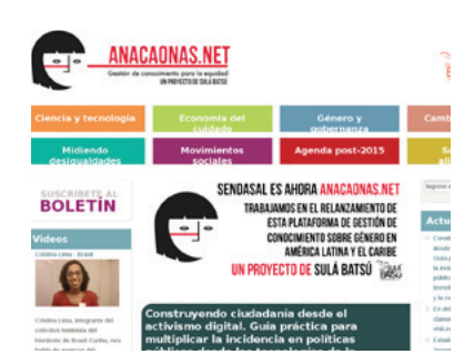
Anacaonas.net will manage information resources on gender issues around the world, create multimedia content to make information more accessible and train actors in the region to use research materials for advocacy and action.

Anacaonas.net, the latest project undertaken by Cooperativa Sulá Batsú, involves the development of a new technology platform dedicated to knowledge management for organisations, institutions and initiatives working on gender issues in Latin America and the Caribbean. The new platform is being developed thanks to a partnership with the BRIDGE programme at the Institute of Development Studies (IDS), University of Sussex.