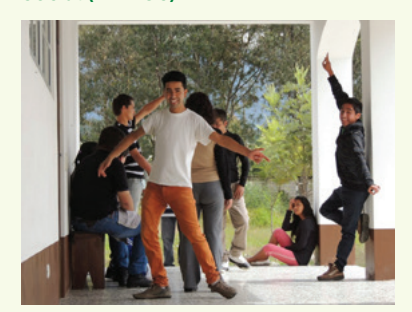
Participants in "Taller Regional de Teatro Grupo de Occidental".

DEMOS is based in Guatemala. Its mission is to promote, strengthen and accompany women, youth and indigenous organisations committed to democratic development processes at the local, national and international level.