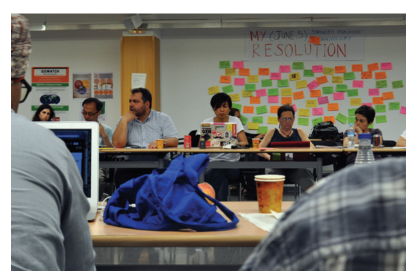
Participants in Take Back the Net! posted individual resolutions to use more transformative technologies to mark 5 June, the first anniversary of the Snowden revelations.