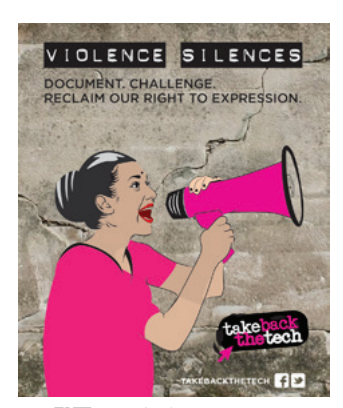
2014 TBTT campaign banner.

As part of the yearly Take Back the Tech! campaign that took place from 25 November to 10 December 2014, 8,617 participants took part in 89 offline actions in 16 countries and 14,528 participants in online actions around the world. To change the perception that calling for actions to prevent technology-related VAW is at odds with promoting free expression, the campaign focused on how online VAW restricts women's freedom of expression.