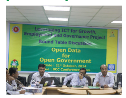
Attendees of the roundtable included different stakeholders, including government, the private sector and civil society.

While government filtering and surveillance carry the risk of privacy infringement and civil rights violations, releasing government data in the public domain offers opportunities for collaboration, engagement and better citizen services. After conducting research on online filtering and internet rights, Bytes for All Bangladesh decided to turn its attention to open data issues.