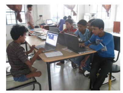
The IPLDP has engaged the local communities, citizens, groups, associations, schools, colleges and others in becoming part of this work and its positive outcomes. PHOTO, DEF.

Through a combination of technology and training support, the IPLDP is helping three district public libraries in the states of Uttar Pradesh and Bihar to bring positive changes by equipping them with capacities to strengthen, organise and deliver